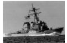
USS Cole (DDG 67)

Fund Established to Benefit USS COLE Sailors and Families Candles of Peace (some graphics and background from USS Cole website)